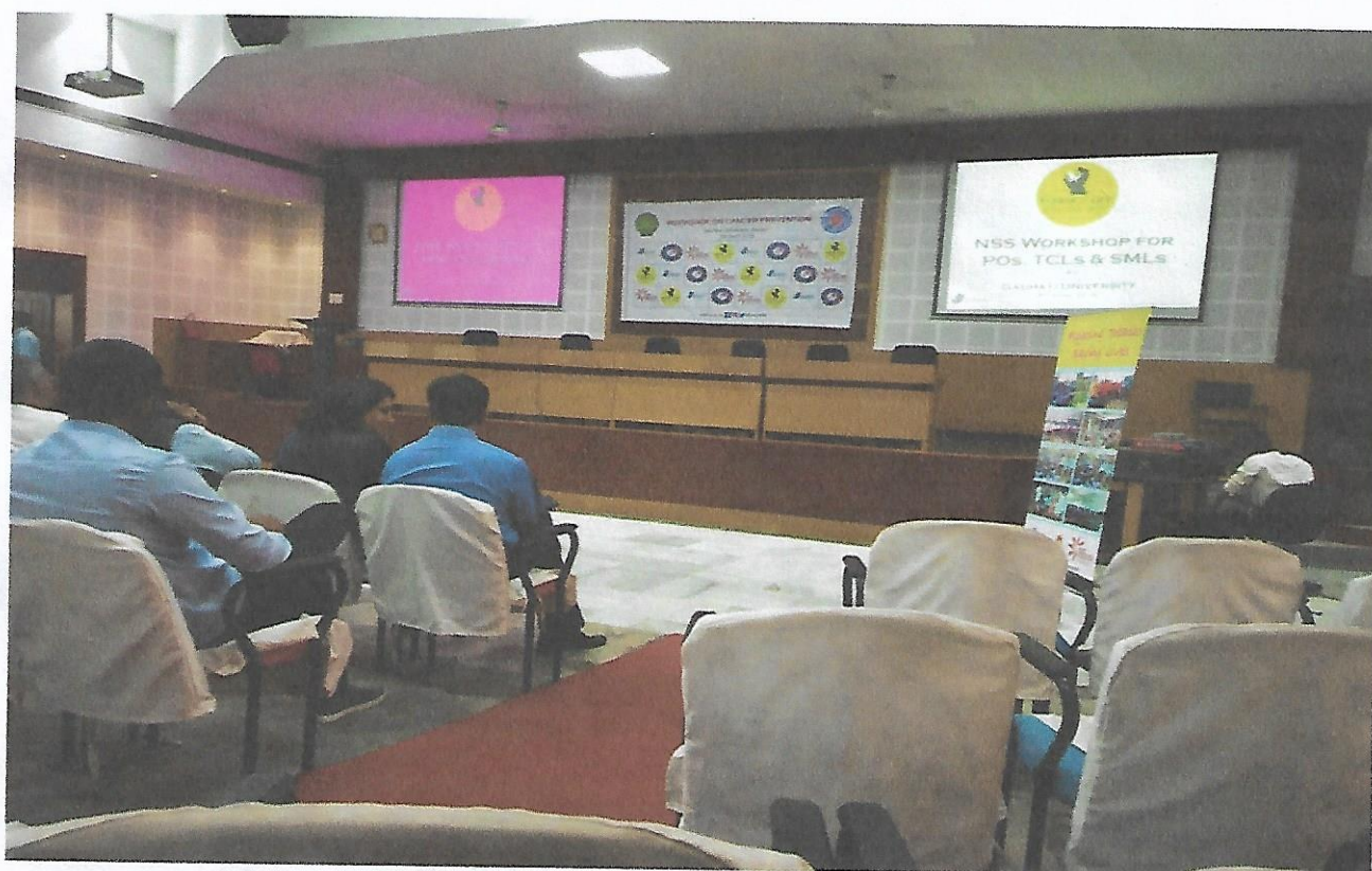
Figure: Photographs from the event